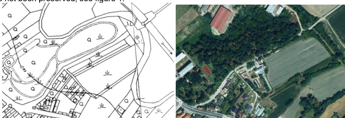
Fig. 1: The public park in the centre of the municipality – historical situation in the early 20 th century (left) and situation before the construction of the chocolate factory in 2021-2022 (right).

The 3-hectare park was established in English landscape style, but the original composition of the park has not been preserved, see figure 1.