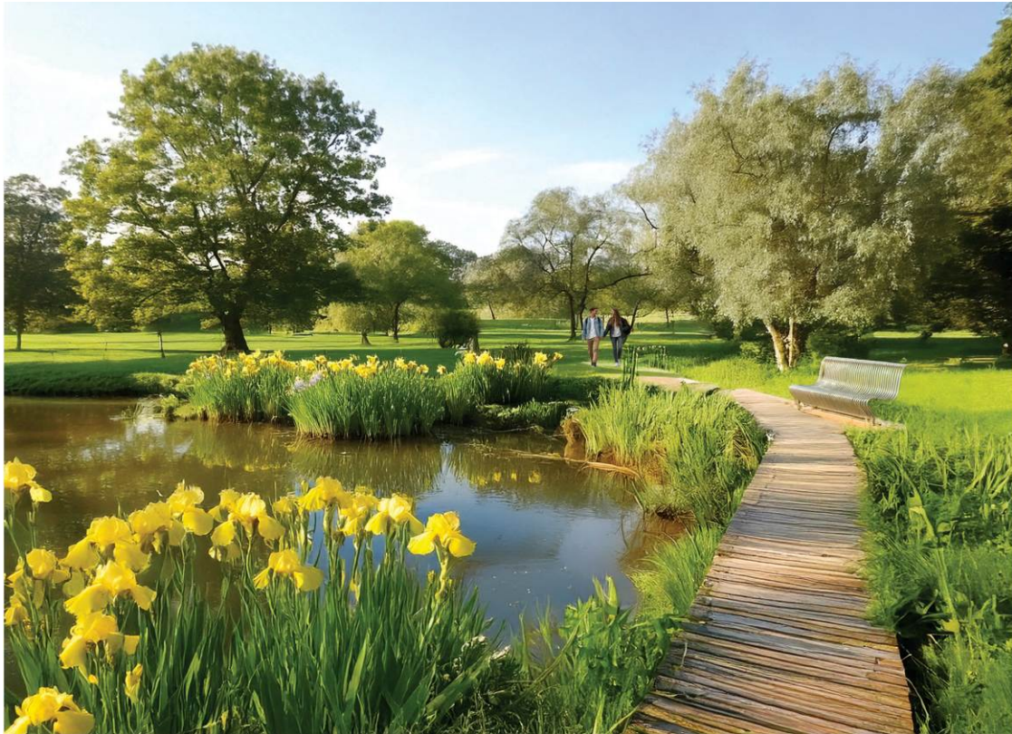
Fig. 4: Visualization of the wetland habitat zone for recreation, nature observation, and environmental education, featuring elevated timber walkways, seating, and meadow areas with sun loungers. (Authors: Králik, Molnárová, Flórová; Supervisors: Kuczman & Paganová, 2025)

The design creates a multifunctional landscape that supports recreational, educational, and ecological functions, integrates technical heritage, and enhances environmental awareness among visitors.