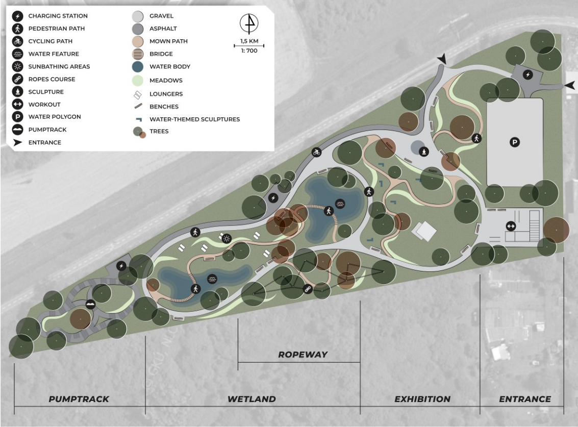
Fig. 3: Functional activity zones in the design area. Entrance zone – water museum exposition (Exhibition), large running loop and outdoor workout area (grey). Wetland – presentation of aquatic and wetland vegetation, Ropeway – a play element for children. Cycling routes and infrastructure (dark grey). Pumptrack – a closed-loop terrain circuit (Authors: Králik, Molnárová, Flórová; Supervisors: Kuczman & Paganová, 2025)

The landscape architectural concept is structured around three interconnected components: an outdoor museum exhibition, a water body with a wetland habitat, and a sports and recreational zone designed for active use (Figure 3).